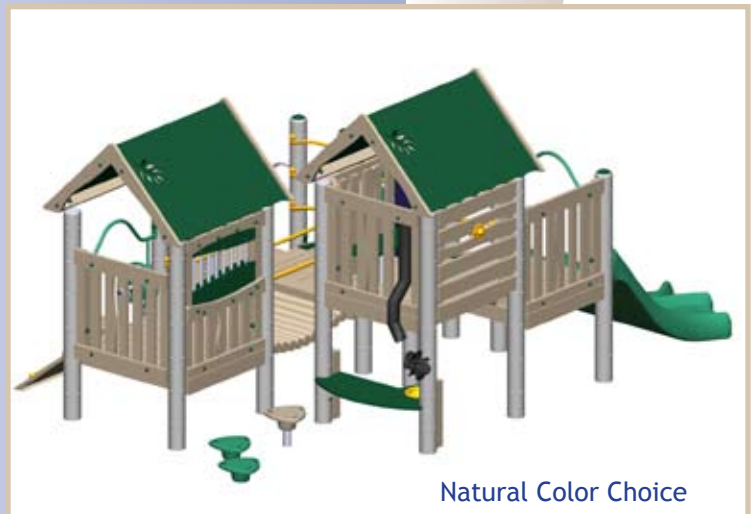
Natural Color Choice

Product development is an on going process. For this reason we reserve the right to make modifications in the form of product improvements in all our products.